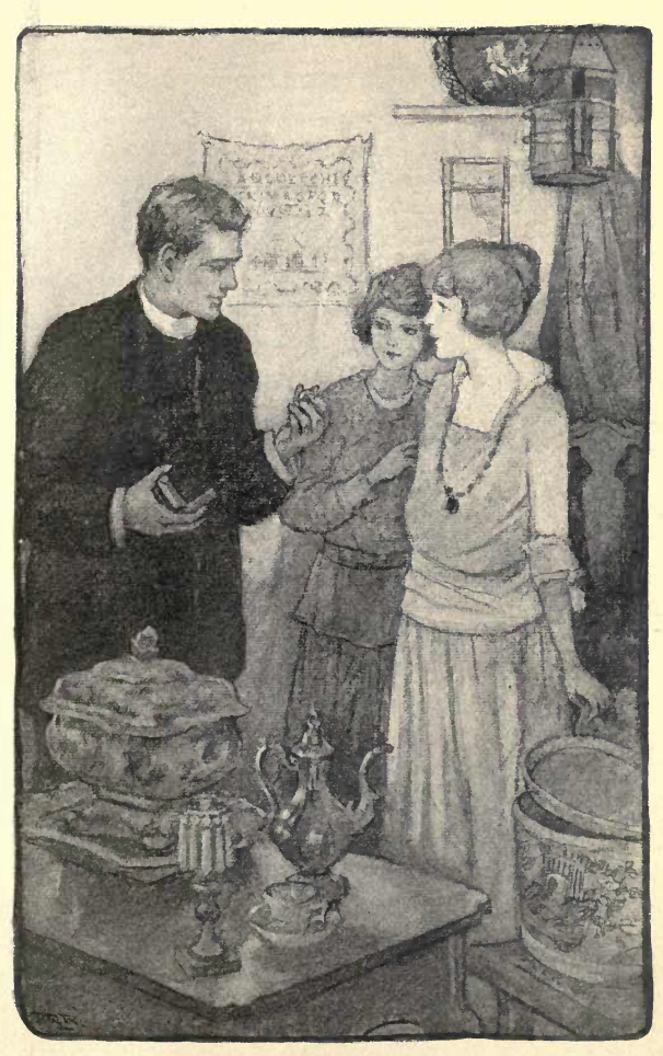
THEN THE GIRLS SHOWED HIM THE ANTIQUES